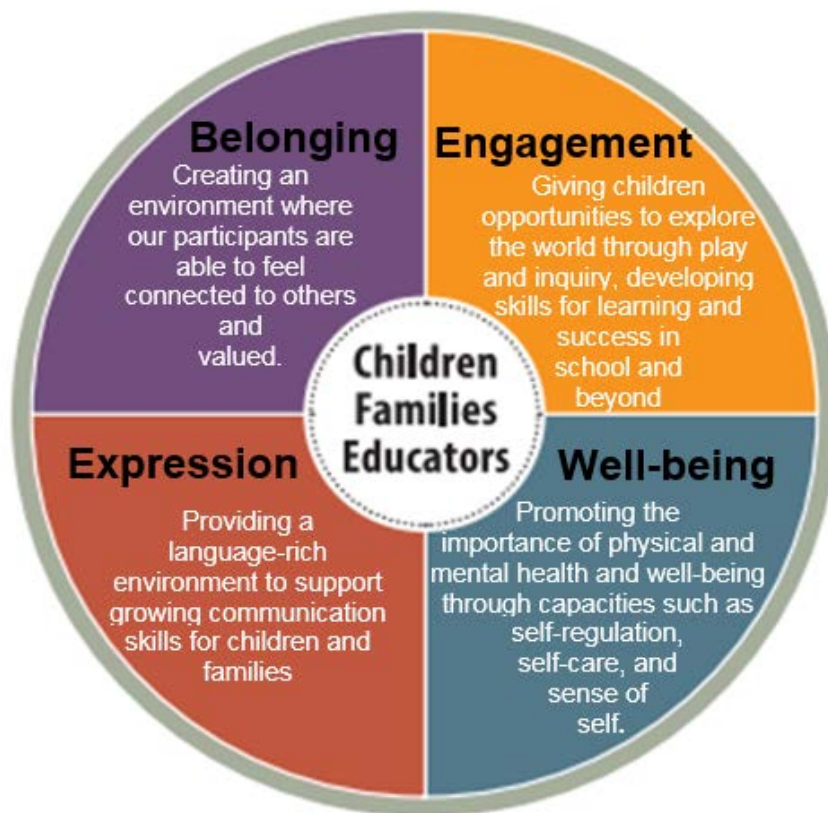
Figure 1. The four foundations ensure optimal learning and development. Adapted from "How Does Learning Happen? Ontario's Pedagogy for the Early Years", 2014.

We believe educators are knowledgeable, caring, reflective, and resourceful professionals. They collaborate with others to create engaging environments and experiences to further children's learning and development.